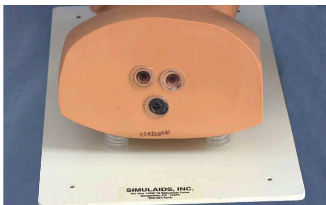
Lungs and stomach removed.

Use water based solutions to clean the trainer. Hot soap and water will take care of most dirt, but if they get grimy then use a commercial cleaner like 409. The airway can be swabbed out